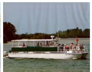
Tarpon Springs Chamber of Commerce 2008 Business of the Year