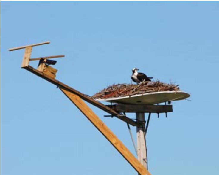
The nesting pair of osprey at St. Andrews Links will likely be spotted in late October or early November. It is entirely possible for them to visit the nest between now and then. One chick began fledging by March 23rd of last year while many other nests in the county were still incubating.

Ospreys, also called 'Fish Hawks', are a protected species and certain guidelines and permits are required when working around osprey nests. Those guidelines can be found at http://www.myfwc.com/ . In general ospreys are tolerant of human activity and have held up well to intense development pressure. Many Florida ospreys, as well as other wildlife, make their homes on golf courses.